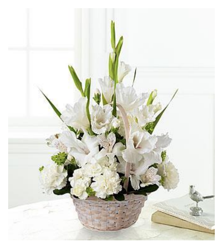
Eternal Affection Arrangement- BASKET INCLUDED